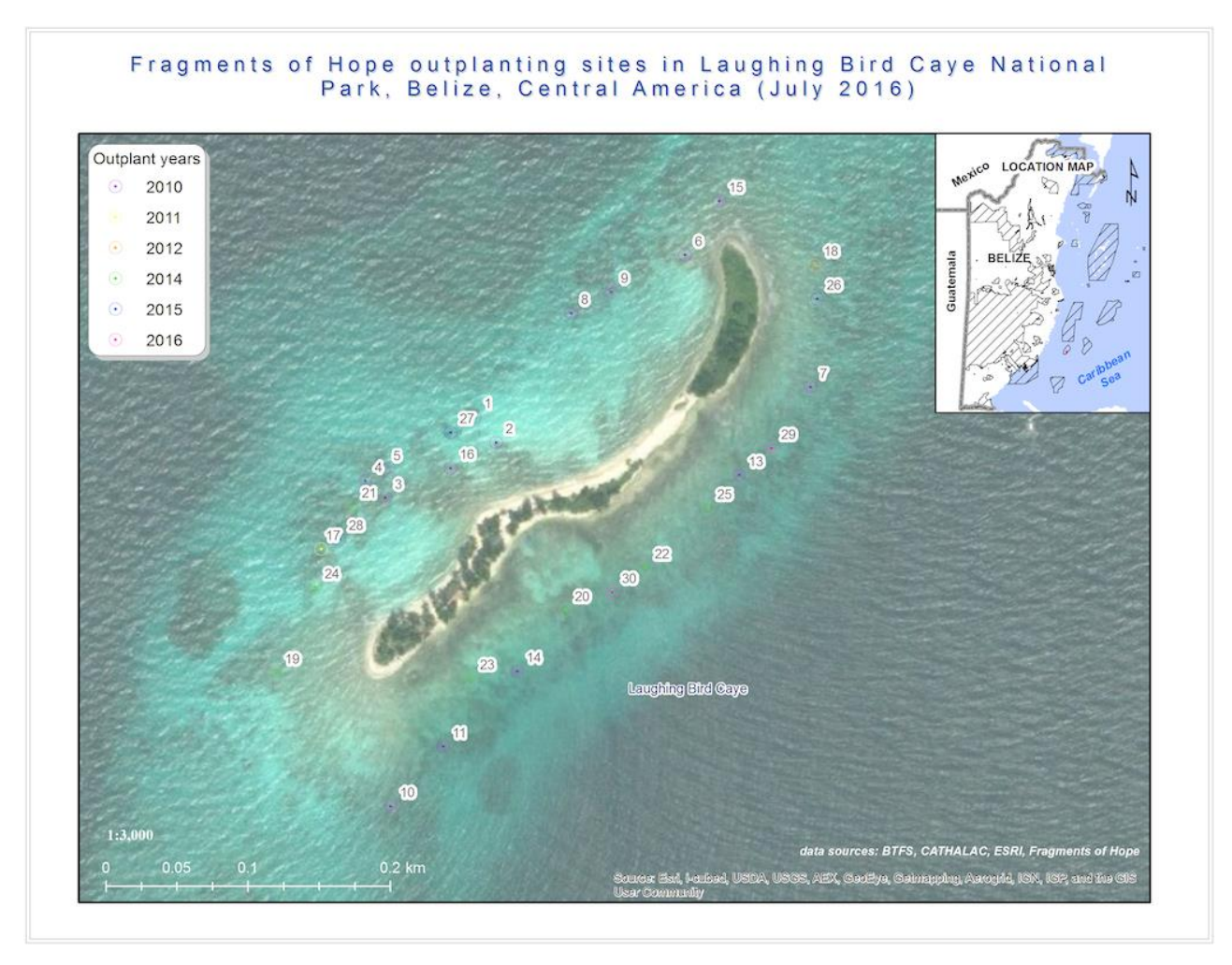
Fig. 1 Map of out-planted subsites at LBCNP with accurate coordinates

second generation corals had been propagated within the coral nurseries. Overall, 3320 A. cervicornis , 808 A. x prolifera and 40 A. palmata , were outplanted into 16 shallow (1-2.5 m) subsites, spaced roughly 1- 10 m apart around Laughing Bird Caye. Outplant locations are described in the following way: reef site (here only LBCNP results are discussed), a subsite refers to smaller areas around the reef site, (n=30, Fig. 1) and plots (n=6, Table 3) are even smaller, accurately measured areas where photomosaics were conducted within subsites. Each subsite was planted with between 41 and 1,000 second generation fragments, with one to eight genotypes and one to three species per subsite. Different genets of each species were outplanted in proximity to each other with recommended distances of 50 cm-10 m for A. cervicornis and 1m-10 m for A. palmata to allow successful cross fertilization (I Baums, pers. comm.). Subsite areas ranged from a few meters square to 1600 m<sup>2</sup>. In 2012-2013, an additional 1,048 fragments were out-planted.