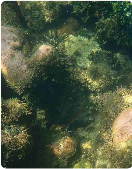
Siderastrea siderea = SSID

WB = Whole Bleached – over 90% totally white-bleached tissue