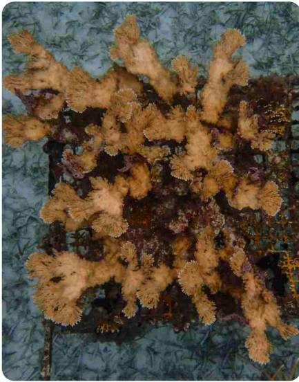
Acropora palmata= APAL

WB = Whole Bleached – over 90% totally white-bleached tissue